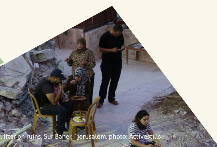
Cover photo - 13/6/2017, Iftar on ruins, Sur Baher, Jerusalem